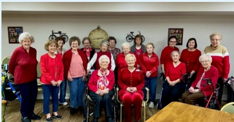
Our ladies in Red