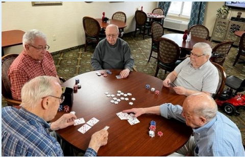
Men's Poker Game started back up!