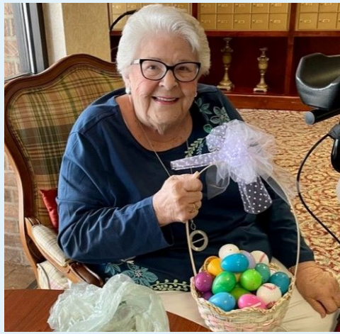
I need another basket please!