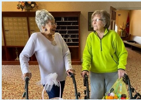
How many eggs did you get?

Pictured right column top to bottom: 1st Baptist Church Ice Cream Social / Baskin-Robbins. Easter Bonnet Fashion Show participants with Angel, our pet friendly Ambassador.