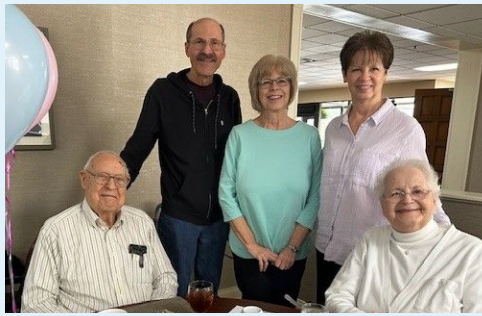
The Lambs celebrated their 73rd wedding anniversary. Congratulations!