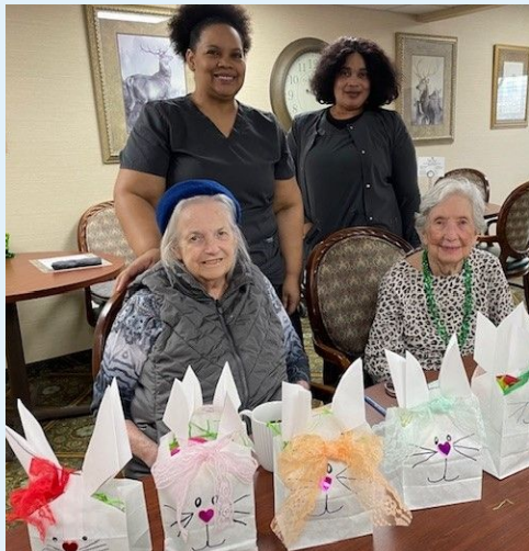
Easter Bunny Bag Craft

Q: I have wings; I have a tail; across the sky I will sail. I have no eyes, ears or mouth, & I bob randomly from north to south. What am I? A: A kite.