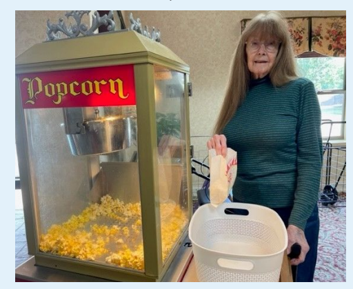
Popcorn, popcorn, who wants popcorn? Served daily in the front lobby.

(Answers: 1. 1987; 2. True; 3. Heart disease)