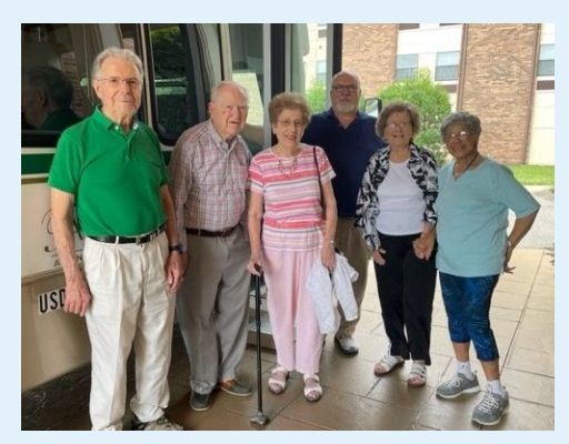
Chocolate Covered Strawberry Cafe, here we come!