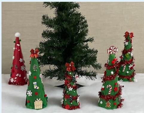
RESIDENT CHRISTMAS TREE CRAFT