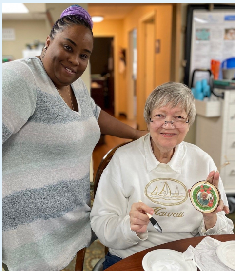
CHRISTMAS ORNAMENT CRAFT

Make Someone's Day Jan. 24 is National Compliment Day.