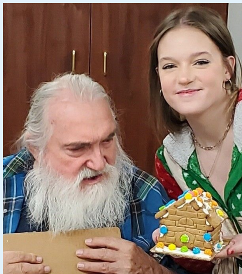
GINGERBREAD HOUSE CRAFT

Make Someone's Day Jan. 24 is National Compliment Day.