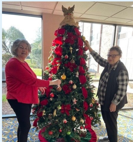
IT'S BEGINNING TO LOOK LIKE CHRISTMAS